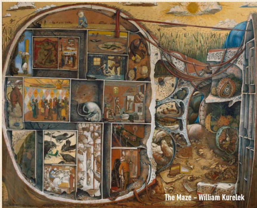
The Maze - William Kurelek